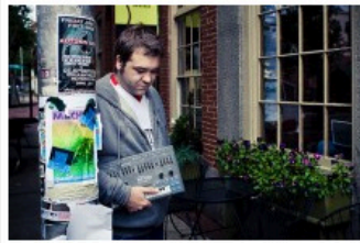
Radio Scotvoid.

What do you envision when you think of electronic music?